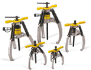
Mechanical & Hydraulic Lock-Grip Pullers, LGM, LGH-Series