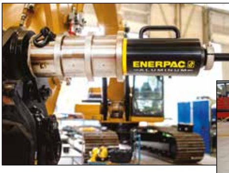
◀ Excavator maintenance using the PPH40 powered by a SC-Series Cordless Pump.