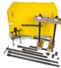
Cross Bearing Pullers, BHP-Series