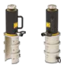
Hydraulic Pin Pullers, PPH-Series