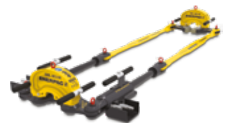
Hydraulic Rail Stressor, RP-Series