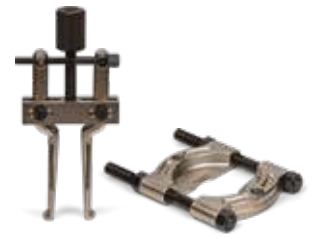
Bearing Cup Pullers & Bearing Separators, BHP-Series