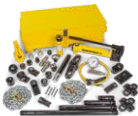
Universal Maintenance Sets, MS-Series