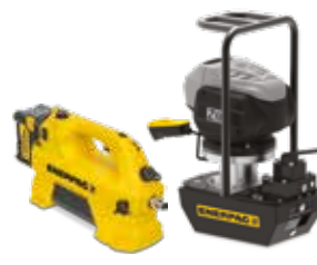
Cordless Hydraulic Pumps, SC, XC2, ZC3-Series