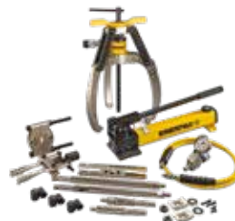
Hydraulic Lock-Grip Master Puller Sets, LGHMS-Series