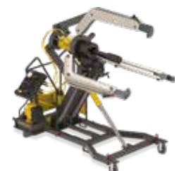
100 ton Hydraulic Lock-Grip Pullers, LGH-Series