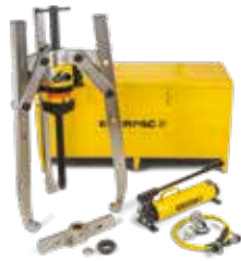
Hydraulic Grip Pullers, BHP-Series