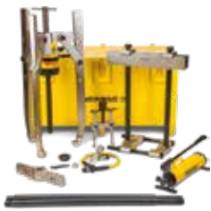
Master Puller Sets, BHP-Series