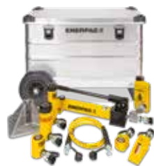
MRO Toolbox Sets, SCTB-Series