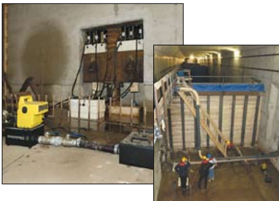
◀ The unique Enerpac RA-Series cylinders – lightweight and entirely made of aluminium alloy – these RAC-506 cylinders are ideal for the positioning of tunnel elements under the river. (High Speed Train Line, The Netherlands)