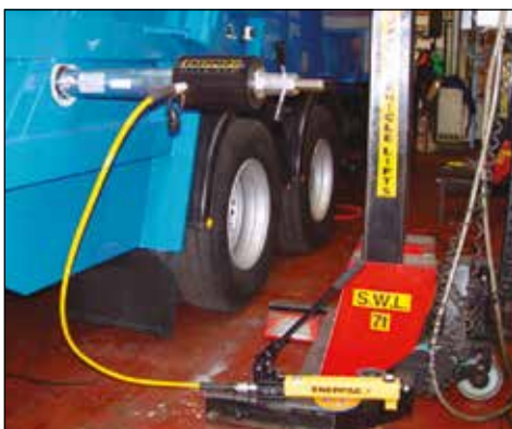
◀ An RACH-306 powered by a P-392 hand pump used to extract corroded carriage pins of refuse collection vehicles.