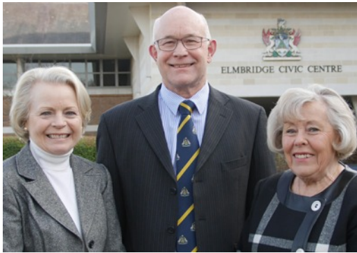
Your residents association councillors for Hinchley Wood and Weston Green Ward (L to R) :