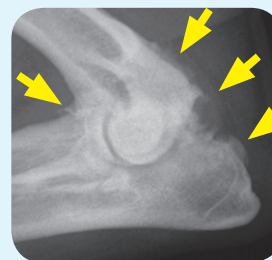
Arthritic elbow joint in a dog with lots of "fluffy" new bone (yellow arrows) around the joint, indicative of marked arthritis.