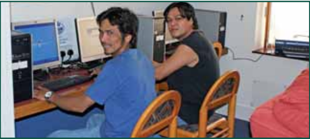
The Belfast Seafarers' Centre has an internet cafe with Wi-Fi hotspot