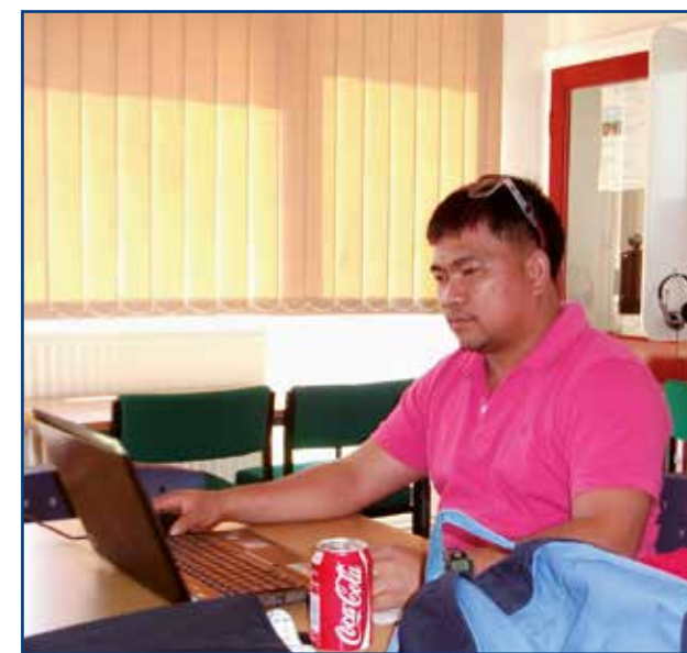
A seafarer making use of the Wi-Fi in the Hull Seafarers' Centre.