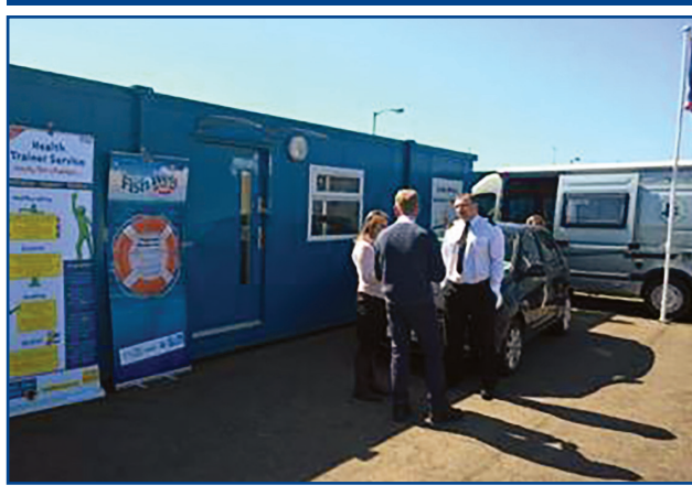
Cabin is open 27/7 (un-manned) • Code for entry available from Port Security office • Free WiFi • Prayer area · Free clothing items