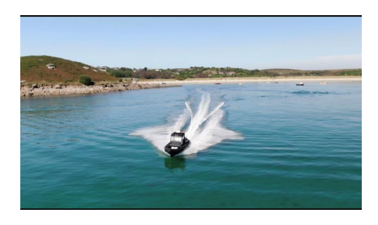
(L)New IFCA vessel at Portland Harbour (R) On station on Scilly