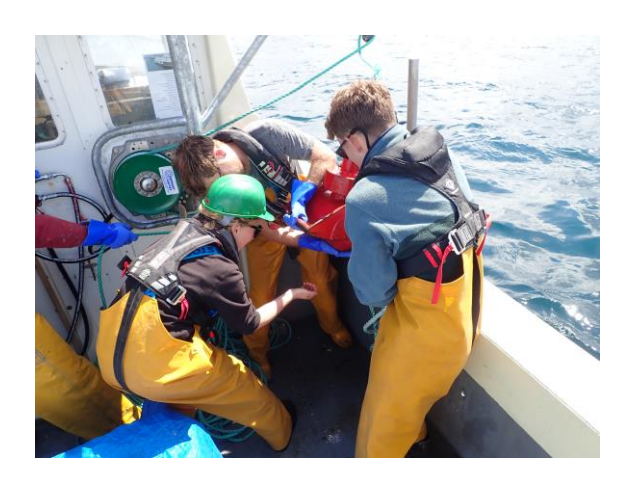
(L)Monitoring the progress of the towed video sled on board Kestrel (R) Catching the grab contents back on the surface