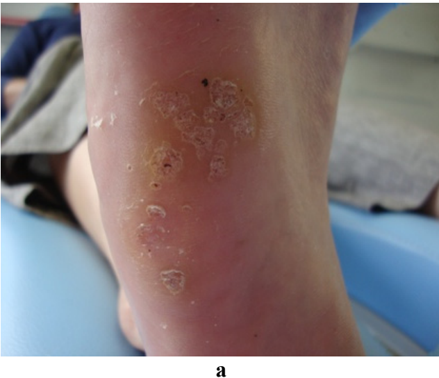
Figure 3. (a) Lateral plantar lesion before treatment; (b) Same lateral plantar lesion during treatment; (c) Same lateral plantar lesion resolved, one month after treatment.