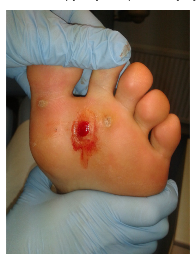
Figure 2. Wart. Immediately post-operatively after undergoing needling.

Pressure was then applied to the wound with sterile gauze and then dressed with a non-adherent sterile dressing (Melolin<sup>®</sup>) and fixing tape (Mefix<sup>®</sup>). A semi compressed felt aperture pad was also applied on weight bearing sites to deflect pressure and reduce post-operative bruising. Each patient was issued with post-operative care sheets and advised to lightly shower and wash the area after keeping the dressing dry for 24 h. Each patient was advised to avoid taking NSAIDs or other anti-inflammatory medication for 48 h to increase the likelihood of a successful controlled inflammatory response. Wound inspection and debridement of any uncomfortable eschar was performed one week later. The final inspection for verrucae resolution was carried out 8 weeks later. Complete resolution was deemed accomplished on return of normal dermatoglyphics to the treated lesion, i.e. , uninterrupted skin striae and no pain on lateral compression of the area. Figure 3a-c demonstrate a lesion before, immediately after and six weeks following treatment.