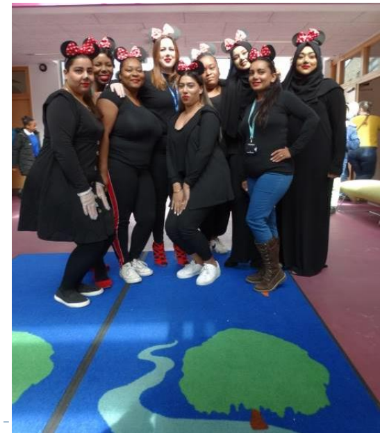
The joint Broadwaters admin team