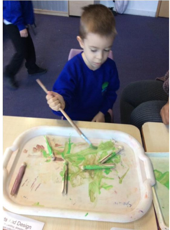
Spider class making items for the Christmas Fayre!