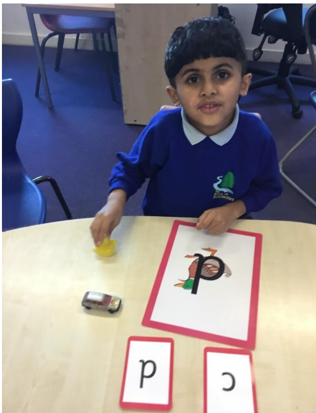
Bumblebee class during their phonics session