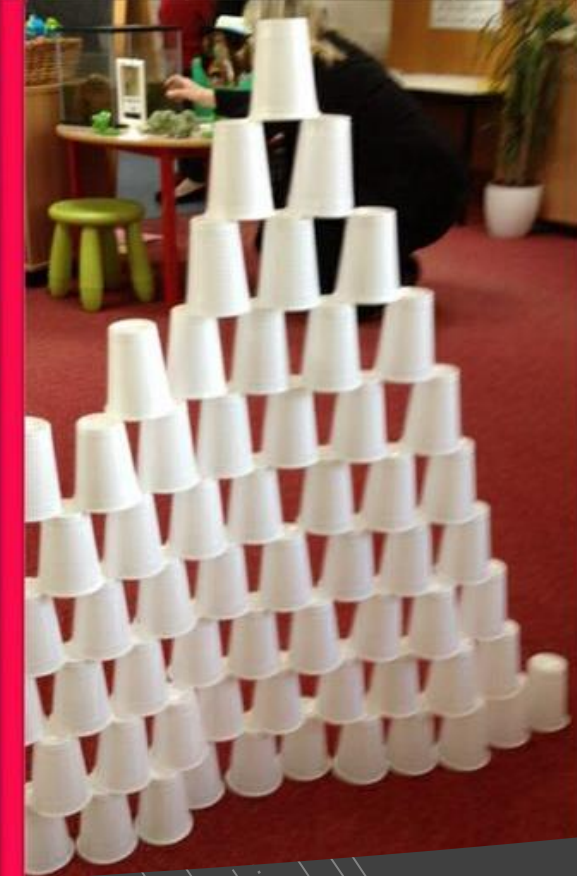
Building with plastic/paper cups