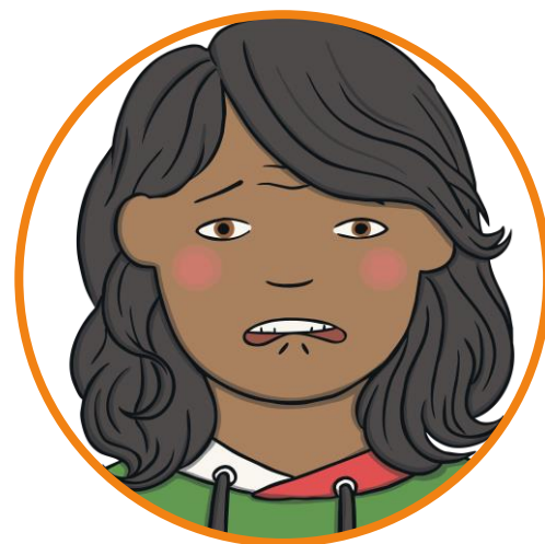
A person may escape their home to avoid getting into trouble .

When a refugee escapes from their home and country, they travel to another place where they will feel safe.