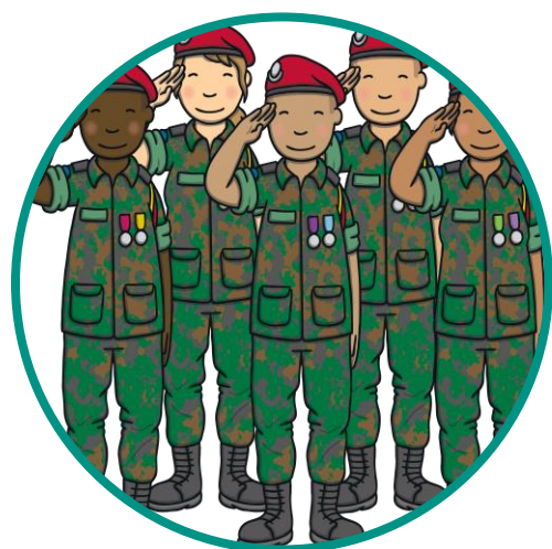
A person may leave their home because of a war.

There are many different reasons why a person would become a refugee.