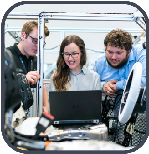
Universities of Applied Sciences