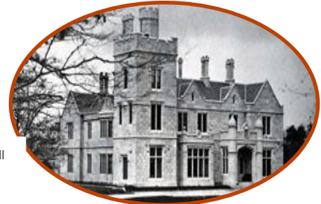
Bottom Right: Historic Aros