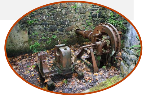
Top right: The original water mill

The THA are aware that the User Groups of Aros Park at present form an important part of its function within the community, be it for dog walking, running, walking or play. FCS and THA will work together to ensure that any development plans complement the current natural, historical and cultural surroundings of the park whilst increasing the footfall of the waterfront and park to generate new economic activity within the town and create new and sustainable employment opportunities.