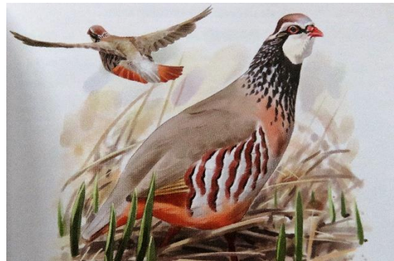
Illustration of the bird

14 Oct Jay reported another small movement of Swallow this morning. At midday Goldfinches and Skylarks were seen near the Hub.