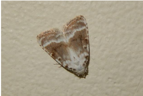
Kent Black Arches