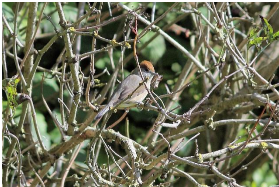
Female Blackcap (SM)

18 Sep Hundreds of House Martins today on Steven's visit, with a few Swallows with them. Also noted were a Grey Wagtail over, 2 Blackcap and 3 Whitethroat.