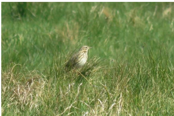
Meadow Pipit on old pitch & putt course

27 Mar My first singing Blackcap of the year on the edge of South Wood and further in a Chiffchaff singing his familiar song. Other birds noted included a pair of Long tailed Tit, an overhead Peregrine and three views of Buzzard. Of interest were two Meadow Pipits singing and parachuting with another 10 passage birds in off the sea.