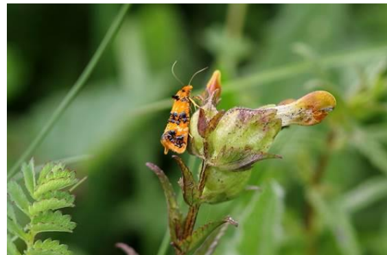
Orange Conch on Yellow Rattle (SM)

4 Jun Libby reported a good number of butterflies around the Hill today including 12+ Common Blues and 6 Small Heath. Earlier there was a possible sighting of a very early Dark Green Fritillary.