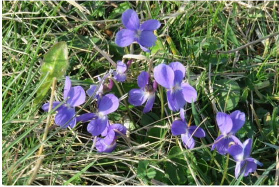
Dog Violets on east facing slope

27 Mar Considering we are still in March there were a dozen butterflies counted on my usual transect route. This is easily the highest pre-April count ever here. Totals were 8 Small Tortoiseshell, 2 each Comma and Peacock. Honey and Bumble Bees were also noted. This spell of sunshine has brought out a few Cowslips and Blackthorn has just started to show.