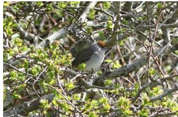
Female Blackcap (SM)

11 Apr The first 3 Whitethroats were seen this morning on Steven's walk round. Also noted were 3 Blackcap, 3 Chiffchaff and a Willow Warbler. The pair of Jays were seen again, and the local Buzzards also. A lone Swallow headed north.