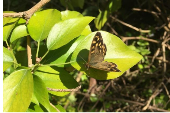
Speckled Wood (LD)

8 Apr Libby spotted 2 Speckled Wood and a Peacock today. This photo of a Speckled Wood, seen in North Wood today: