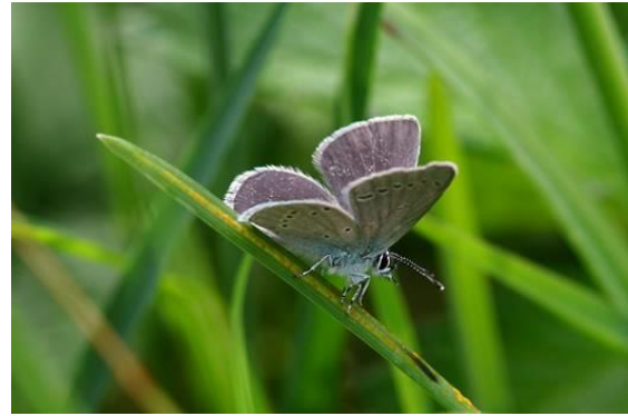
Small Blue (SM)