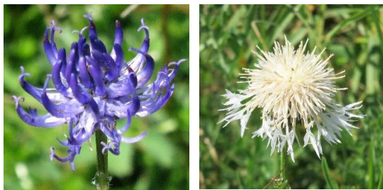
Round headed Rampion Greater Knapweed

Jun 22 The second day of Summer produced in excess of 100 butterflies on my count. The totals were 50 Meadow Brown, 35 Small Heath, 12 Marbled White, 2 each Large Skipper and Common Blue and singles of Green veined and Large White. Also noted were my first Round headed Rampions of the year, Lady's Bedstraw, Rest Harrow and Field Scabious, and a white form of Knapweed.