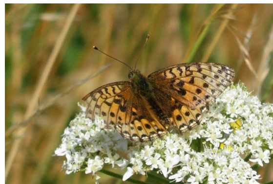
A rather worn Dark Green Fritillary

July 24 An earlier start than normal as the forecast of high temperatures was a bit of an experiment. A slight downturn, with no Marbled Whites, but pleased with 3 Wall and 2 Dark Green Fritillary. Gatekeepers came out on top with 84, followed by 25 Meadow Brown, 10 each Large White and Small Heath. Others were 6 Small Skipper, 5 Small White, 2 Red Admiral and single Common Blue and Ringlet. Flowers noted were Squinancywort and Bastard Toadflax (short diversion to check the old dewpond) plus Melilot, Burnet Saxifrage, Marjoram and St John's Wort.