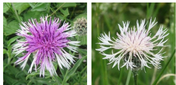
Further colour variations of Greater Knapweed

July 5 With little sun but humid and warm conditions there was another decent butterfly count this afternoon. The total was 230 consisting of 81 Marbled White, 70 Meadow Brown, 20 Small Skipper, 19 Small Heath, 17 Gatekeeper, 15 Small White, 4 Ringlet, and single Painted Lady, Brown Argus, Dark Green Fritillary and Common Blue. New plants in flower were Common Toadflax, Rock Sea-lavender, Spear Thistle, Stemless Thistle and Woody Nightshade.