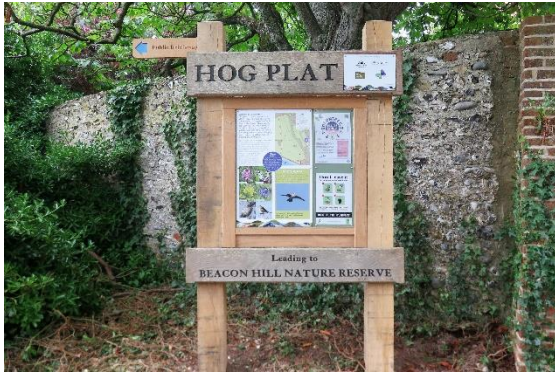
The new Hog Plat sign

July 9 The first of the Fauna and Flora school trips was with St Margaret's. The colourful reserve was seen at its best with the yellows of Lady's Bedstraw, whites of Wild Carrot and Yarrow, the pink of Rest Harrow and the purple of Knapweeds. Dozens of Marbled White seen. Groups were split into three and it was pleasing that one young lady could identify from what species a feather came from. Afterwards they were given a tour of the Windmill.