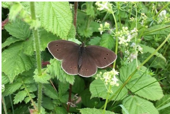
Ringlet by Libby

Jun 24 Another butterfly count from Libby with 3 Painted Ladies, 30 Marbled White, 37 Meadow Brown, 15 Small Heath and 2 Ringlet. Well spotted Libby as the two Ringlets were the first since 2015.