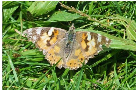
A rather worn Painted Lady

Jun 28 A mini-heatwave certainly brought out the butterflies today and could have been even more had the wind been a little less strong. Twelve species totalling exactly 200: 83 Meadow Brown, 43 Marbled White, 37 Small Heath, 17 Painted Lady, 5 Small White, 4 Small Skipper, 3 each Ringlet and Dark Green Fritillary, 2 Common Blue and single Large Skipper, Large White and Red Admiral. Cinnabar and Hummingbird Hawkmoth also noted. Creeping Thistle joined Knapweed for nectar plants for butterflies. Plants now in flower included Meadow Vetchling, Black Horehound and Hogweed.