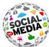
Social Media & BSP Labels