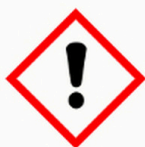
Chemical Label Legislation