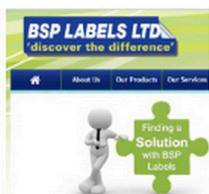
What's New @ BSP