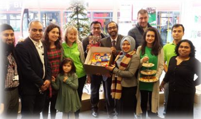
Volunteers with Green Street councillors.