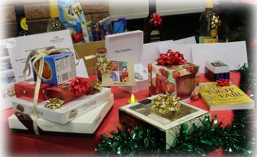
Some of the prizes donated for the volunteers raffle.