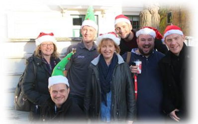
activeNewham Senior Leadership Team ready to deliver hampers!