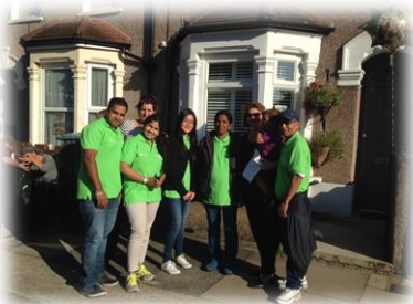
Morley Road street party.