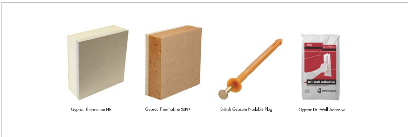
Figure 1 Drilyner \tau – system components

1.2 The boards are available with the nominal characteristics shown in Table 1.