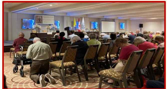
from the Serra international convention Toronto

You can also browse through our resources page on our website, to help you focus, particularly on your vocation in life or that of religious vocations, during that special time with Our Lord. Download and print off for your own or your parish use. Encourage prayer for all vocations.