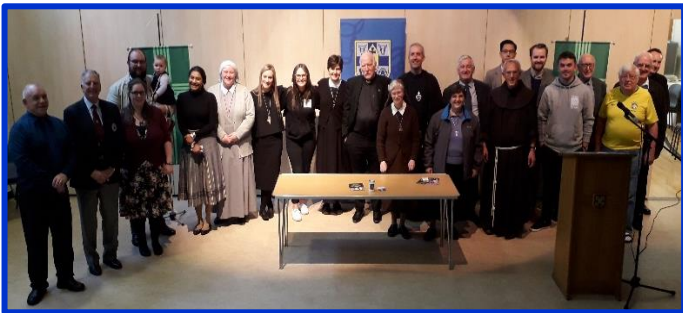
A travelling vocations team comprising priests from dioceses, religious orders and sisters and brothers and of course our Serrans.

We have reached that time of the year when our focus is turned to our schools events. Pupils generally from our senior fifth and sixth years having completed their exams and applying for university, college etc. are considering their future careers, spend some time in the company of our religious guests mainly diocesan priests and brothers and sisters from religious orders. There is an opportunity for the students to engage with our guests asking questions about their work and vocation choices. The object of this programme is not to badger or harass the students but hopefully just plant the seed or notion of vocation as their lifestyle choice. The one day programme finishes with our vocations mass.