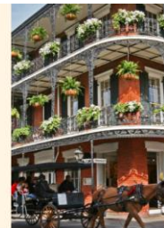
The French Quarter

Cathedral of St. Louis & the Shrine of Our Lady of Prompt Succor