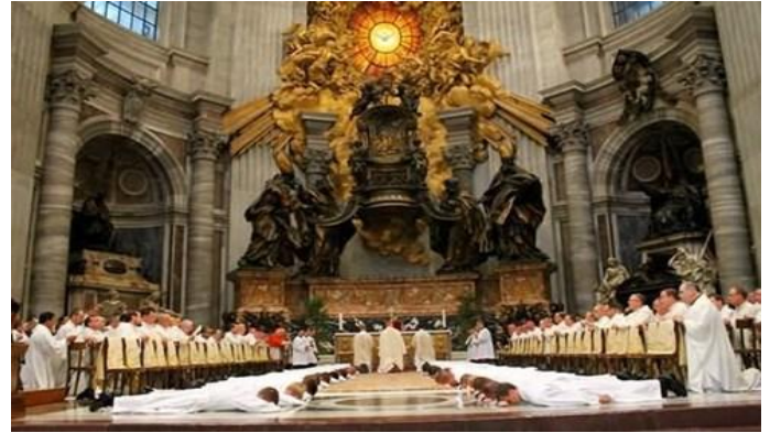
Ordinations in St Peter's basilica in Rome

The solemnity of St. Peter and Paul honours the martyrdom of the two saints, sometime between AD 64 and AD 68. While the church recognizes that they may not have died on the same day, the celebration is of ancient Christian origin and the date selected being the anniversary of their deaths.