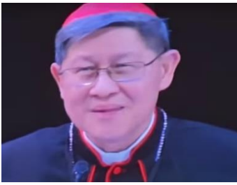
Cardinal Luis Antonio Tagle, pro-prefect of the Vatican's Dicastery for Evangelization and many times keynote speaker at our Serra International conventions, particularly in Asia.

His Eminence says that there are many ways of influencing others, but as Christians they must be inspired by the Gospel. In his recent talk directly to priests at the "Conference for the ongoing formation of priests" held by the Dicastery for the Clergy to which we are aggregated, His Eminence asks all priests "to be inspired by the Gospel." Listen to his talk here