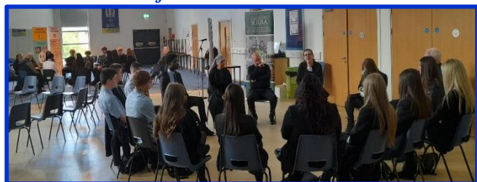
The students of fifth and sixth years