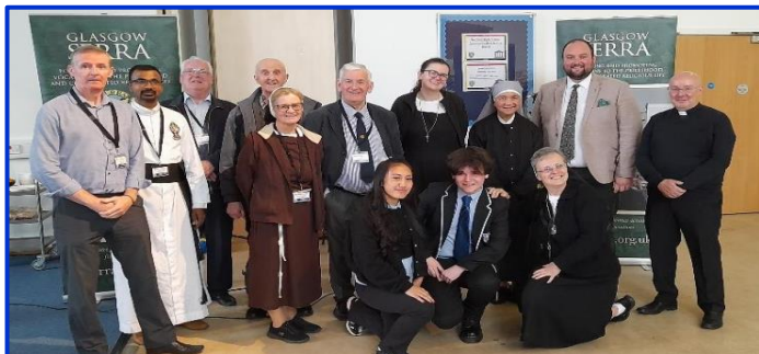
Our travelling vocations team comprising priests from dioceses, religious orders and sisters and brothers and of course our Serrans.

We have reached that time of the year when our focus is turned to our schools events. Pupils generally from our senior fifth and sixth years having completed their exams and applying for university, college etc. are considering their future careers, spend some time in the company of our religious guests mainly diocesan priests and brothers and sisters from religious orders. There is an opportunity for the students to engage with our guests asking questions about their work and vocation choices. The object of this programme is not to badger or harass the students but hopefully just plant the seed or notion of vocation as their lifestyle choice. The one day programme finishes with our vocations mass.