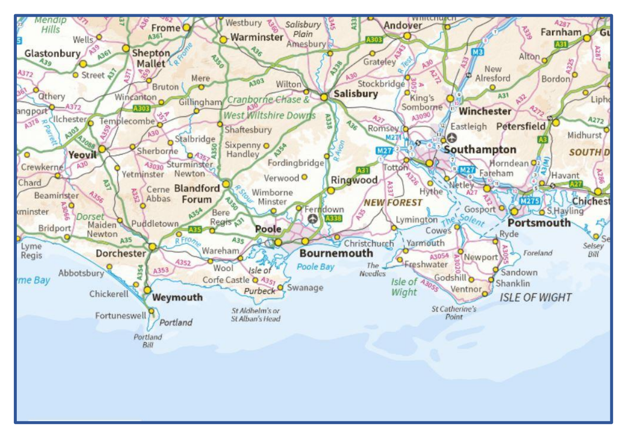
Figure 1. Map of the 3Cs South Location

their neighbours; Dorset, Devon and Solent have worked together in the past on a MMO project on stakeholder engagement for marine plans and the Solent Forum is helping to support the establishment of the Sussex Marine Forum.