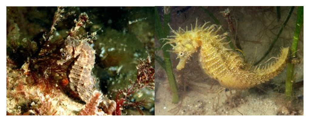
Short Snouted Seahorse

Purpose: To help build a better understanding of the presence and distribution of this protected feature, and reduce potential impacts