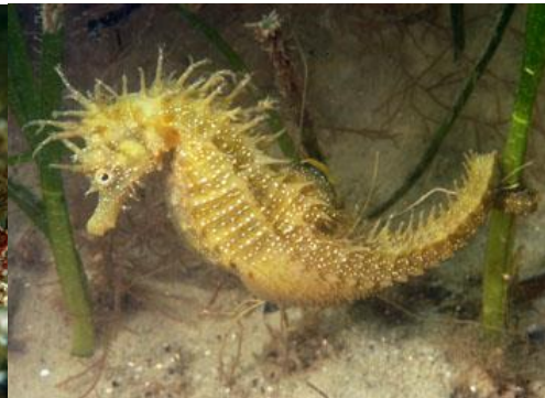
Long Snouted Seahorse