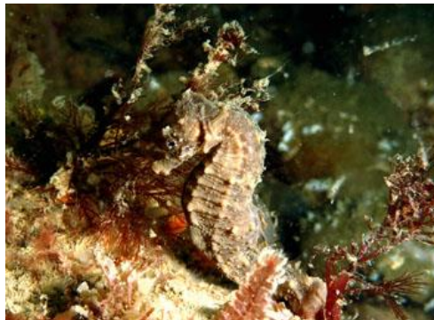
Short Snouted Seahorse

Purpose: To help build a better understanding of the presence and distribution of this protected feature, and reduce potential impacts