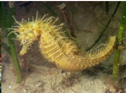
Long Snouted Seahorse

For further information on Selsey Bill and the Hounds MCZ management see: