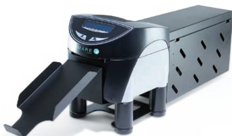
Stima CLS with Catchment Tray and Ticketsafe

http://www.stimare.net/desktop-ticket-printers/stima-cls-thermal-ticket-printer/