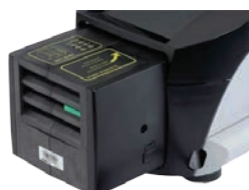
Stima CLS with Triple Feeder