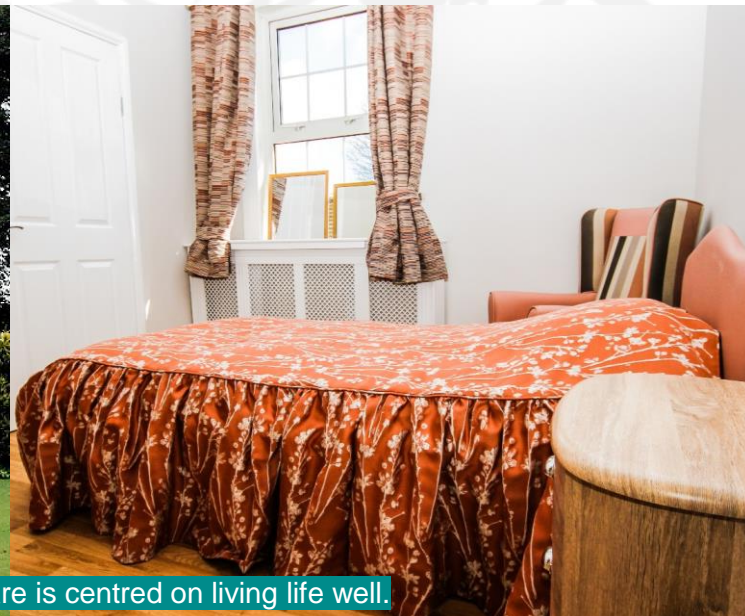
Moorlands Nursing Home; where care is centred on living life well.

Moorland's Nursing Home is situated in a quiet residential road in Brinsley, Nottinghamshire.