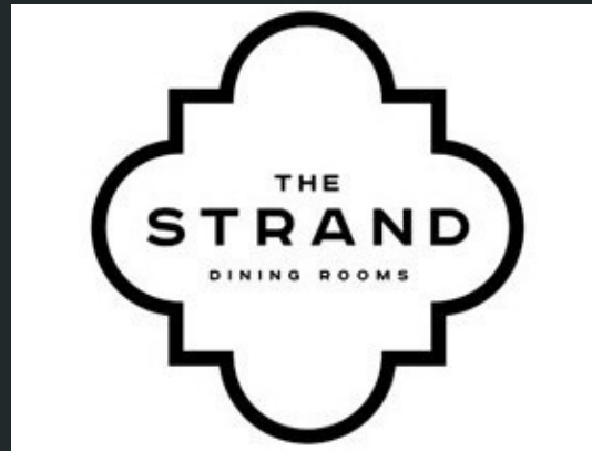
Liam Chamberlin Strand Dining Rooms - GM http://thestranddiningrooms.com/