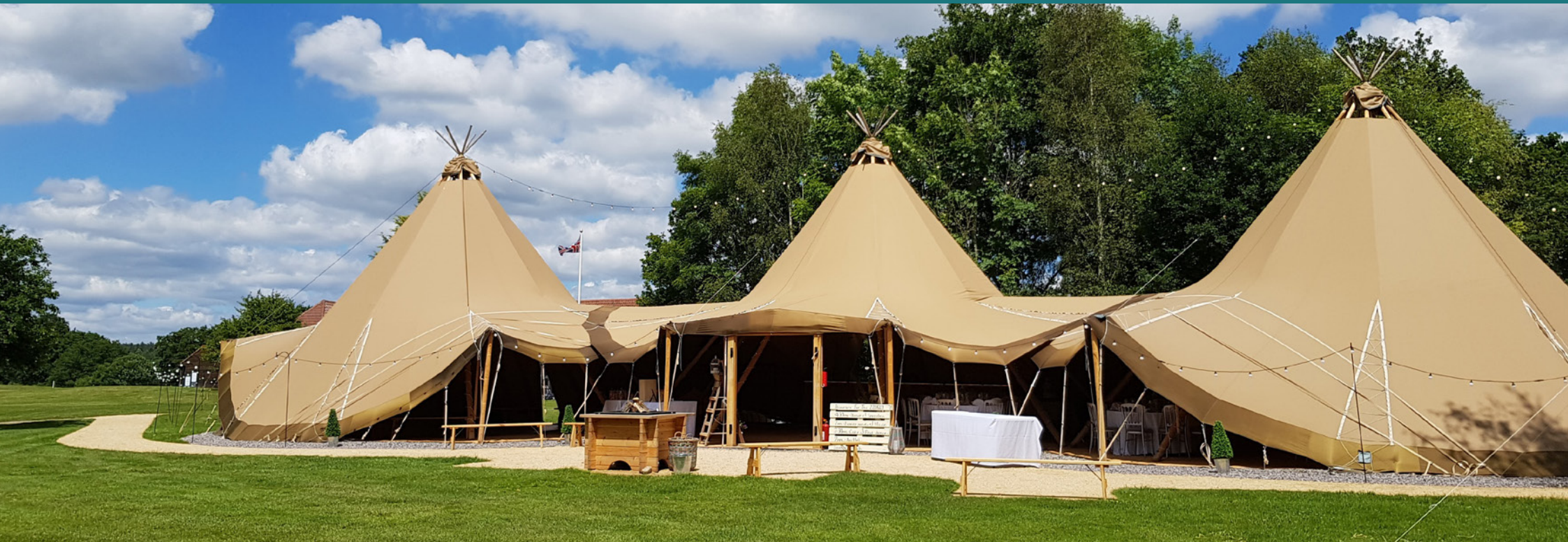
The Woodlands Tipi