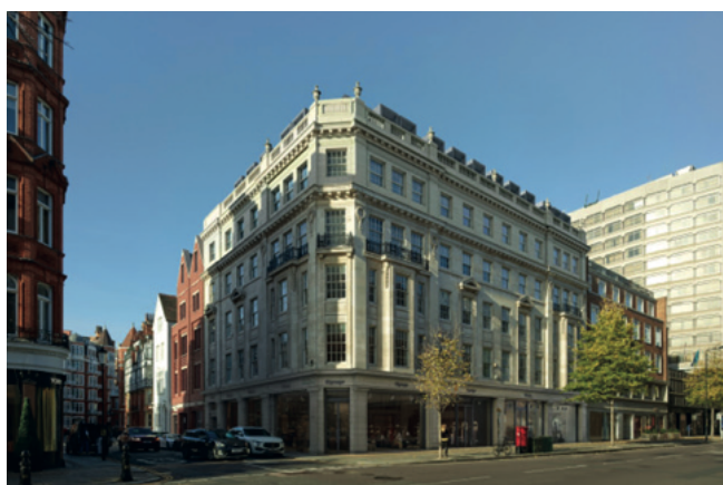
cgi of 30–33 Sloane Street showing the proposed 2 extra storeys

July 2022, and made a number of objections prior to commenting to the Council. Cadogan arranged a further meeting with us in recent weeks but our objections to various aspects remained.