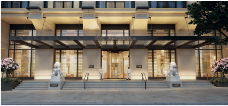
The grand entrance to the Peninsula Hotel