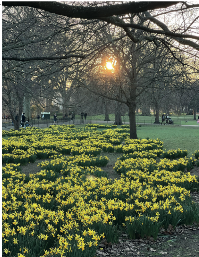
Spring daffodils in Hyde Park

addresses the resource asymmetry where Councils and developers draw on full-time salaried staff and amenity societies rely on a small cadre of committed volunteers supported by expensive external consultants. In my view, the model is one-sided and needs to change.