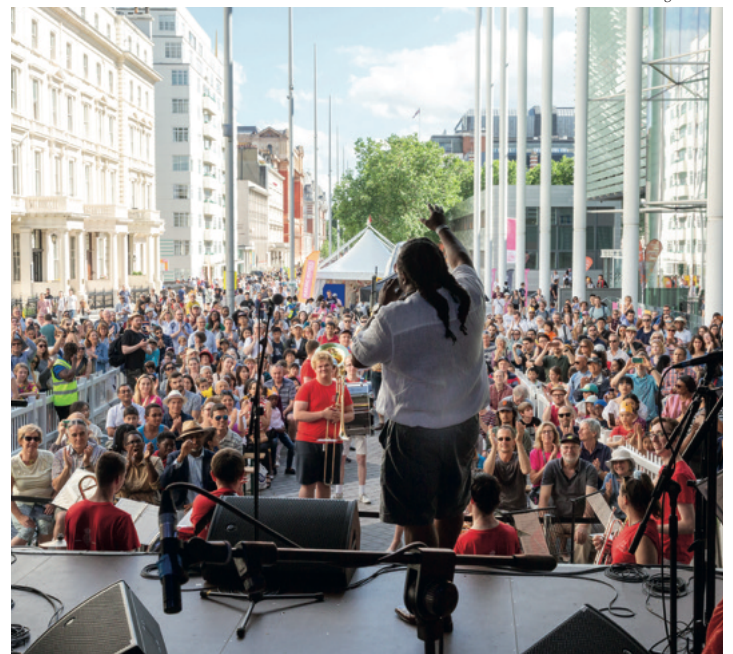
Exhibition Road en fête

Returning for another year on 17–18 June the Festival is a celebration of science and the arts with a weekend of free events for all ages. The weekend will be packed full of events from Imperial College, the Natural History Museum, Science Museum, the V&A and more. There will be an eclectic range of performances on the main stage from the Royal Albert Hall and the Royal