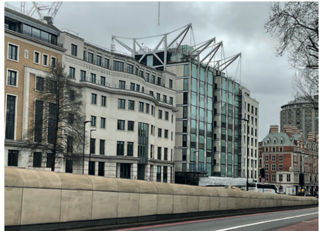
The crane-like structures overhanging the new hotel

The Berkeley Hotel's redevelopment of 33-39 Knightsbridge, designed by the late Richard Rogers RHSP architectural practice, and originally intended as an extension of the Berkeley with additional rooms and residential apartments, is