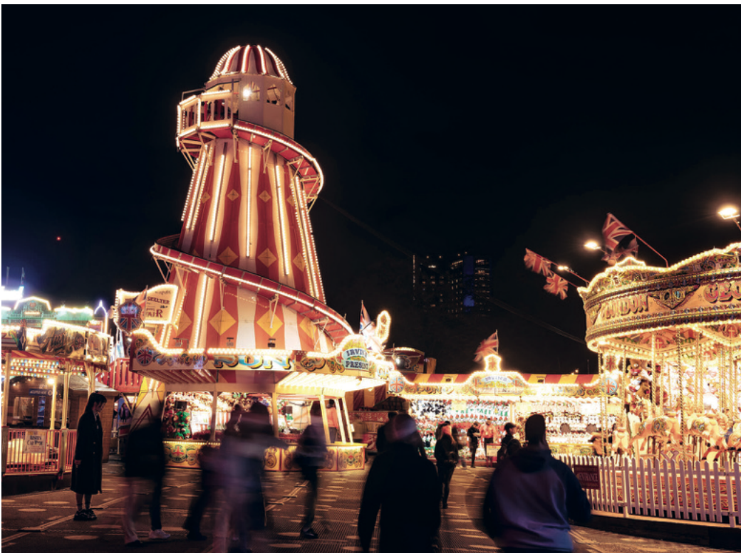
Winter Wonderland 2022