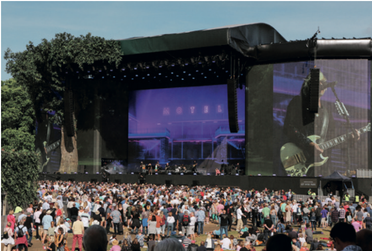
BST Concert 2022

Once again, this year Hyde Park will host 'American Express presents British Summer Time' (BST) – its tenth anniversary – Hyde Park Winter Wonderland and The Royal Parks Half Marathon as well as other smaller events. These will all entail some road closures and details of these can be found on the website royalparks.org.uk