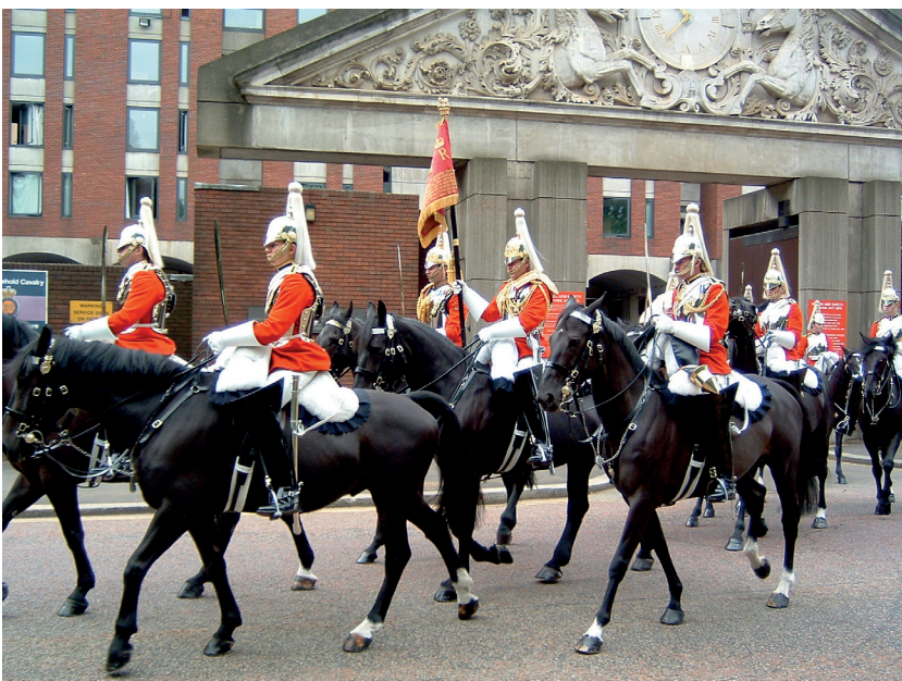
The Household Cavalry outside Hyde Park Barracks

Please watch for more news including an update about the Referendum which could take place in late June or the Autumn.