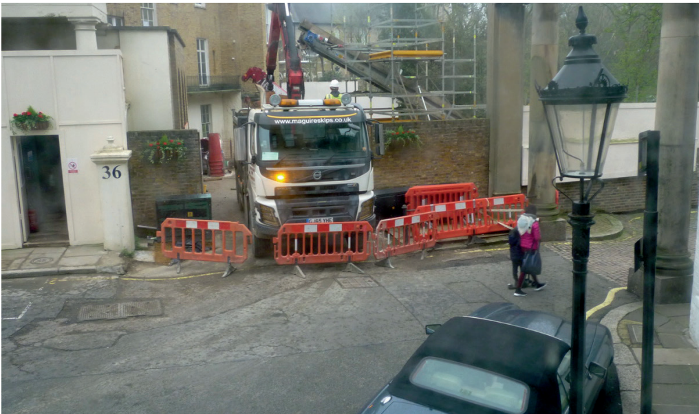
31 Brompton Square. Concerns remain for the stability of the Mews arch and public safety

in the UK. And to the relief of everyone the contractors are already on site. External works should be complete by December of this year.