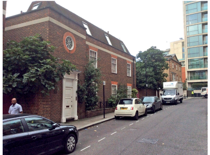
Demolition of the west side of Lancelot Place includes no. 15. For details see pp2 and 3.

Members of the Committee have met with Anthony De Roche of WCC to discuss the impact of the proposed works with regard to traffic congestion and pollution, including having a WCC traffic marshal on site during working hours.