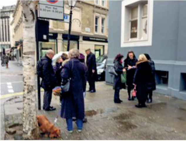
Meeting the Council outside Bonhams on a rainy day

the dangerous lifting of the pavement outside Bonhams by the roots of the silver birch tree. Another matter perplexing residents was why in some listed terraces, some houses have mansard roofs whilst recent applicants have been refused permission.