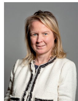
Felicity Buchan MP