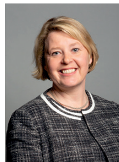
Nickie Aiken MP

Felicity Buchan won the Kensington seat from Labour reversing the number of votes by which the Conservatives lost the seat in the previous election.