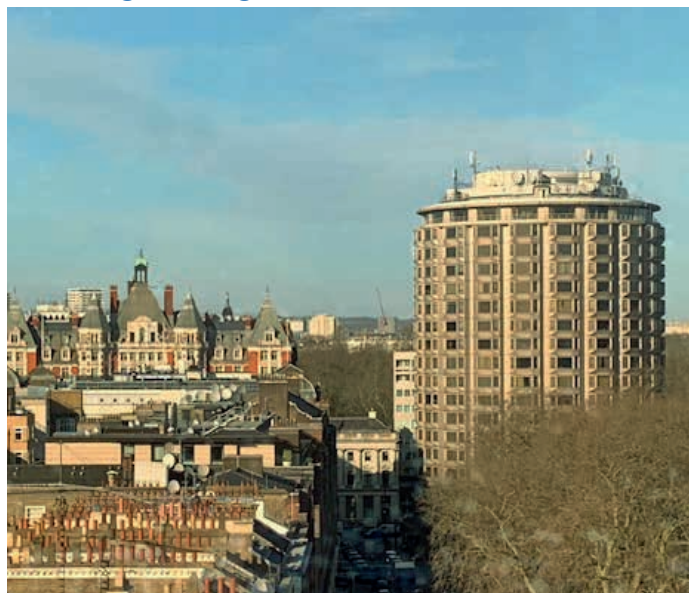
Already the tallest building by far

The plans to refurbish the hotel, increase the height by several storeys and significantly improve the two-storey ground floor podium and streetscene were approved by RBKC's Planning Committee in April.