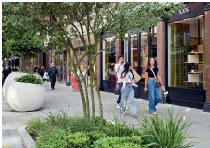
Sloane Street revitalised

Many of you will remember the Piccadilly Underpass closures that took place in 2023. Those works, over a number of months, reduced the two traffic lanes to one in each tunnel. The works also involved running new cables and installing new fire safety equipment e.g. heat detection, incident detection and a public address system. The new road layout has worked well.