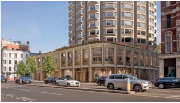
The two-storey podium cgi

higher than is typical for Knightsbridge and juts out way over the rooftops.