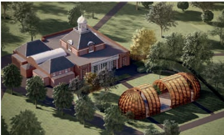
Aerial view cgi