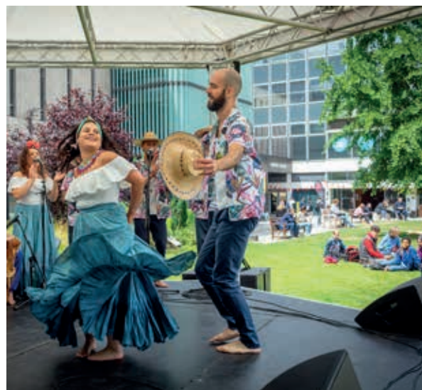
Family picnic with music and dancing