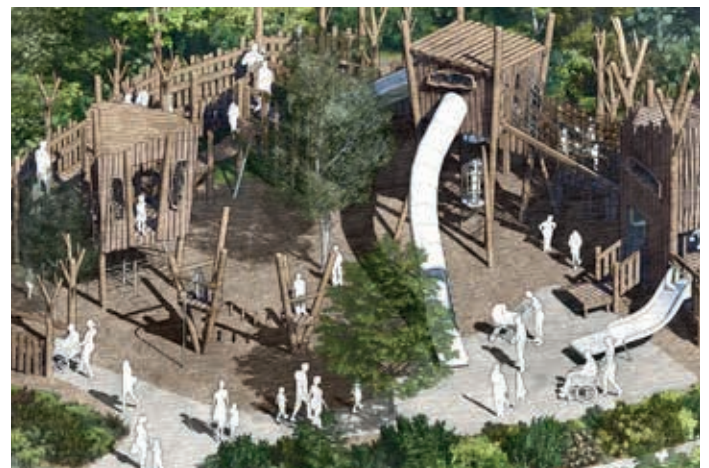
Impression of the Tree House Encampment cgi

The Royal Parks charity is undertaking a multi-million pound renewal of the playground in Kensington Gardens which opened in 2000.