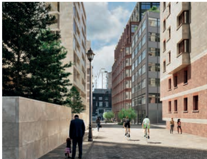
The overbearing effect of the new building (rt side) cgi