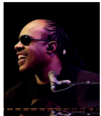
Music legend Stevie Wonder will be topping the bill in Hyde Park as part of the LOVE, LIGHT & SONG UK 2025 performances