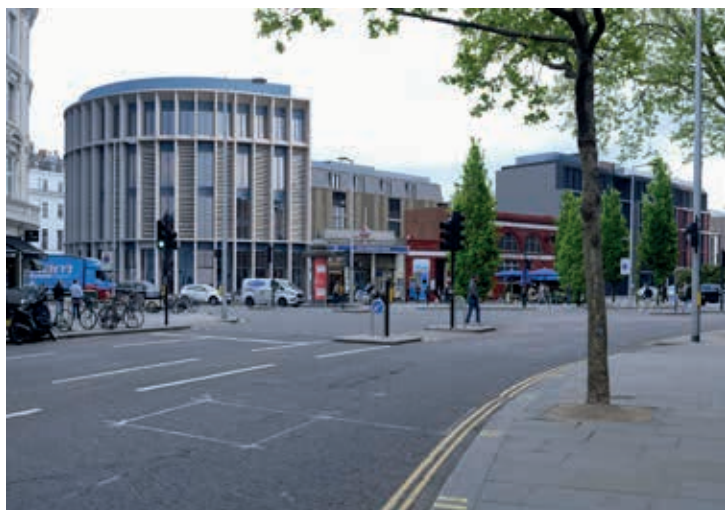
The bullnose building viewed from Old Brompton Road cgi

The plans to upgrade and partially redevelop South Kensington station, which were opposed by RBKC, Kensington MP, Felicity Buchan, and all the local residents' associations (on the grounds, inter alia, of overdevelopment, insensitive design and insufficient step-free access), were approved on Appeal in December 2023.