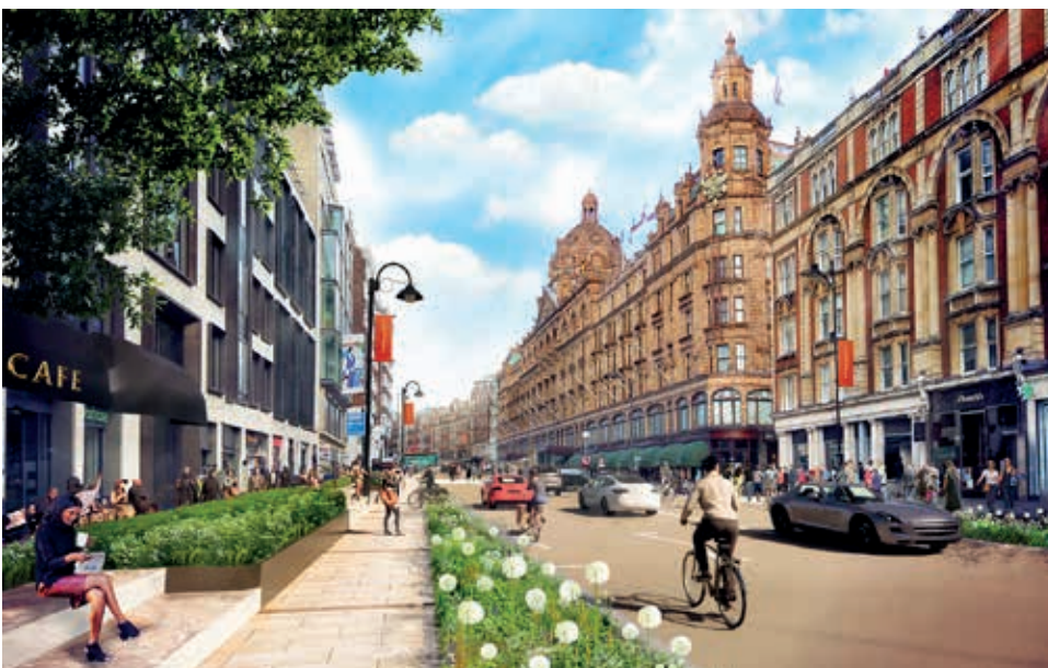
View looking east up Brompton Road cgi

More details can be seen here: knightsbridgepartnership.com/article/knightsbridge-place-and-public-realm-strategy-update/