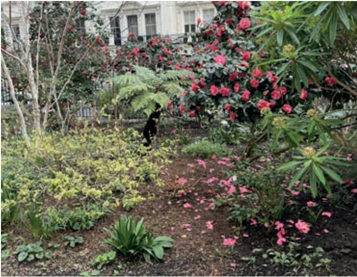
Camellias in Ennismore Gardens

London Open Gardens is the annual event where over a hundred normally closed or hidden green spaces open their gates to the public. Discover rooftop gems, community spaces and historic walled enclosures. Walks are also offered and special access opportunities to meet some of the people managing green space for nature, climate and people.