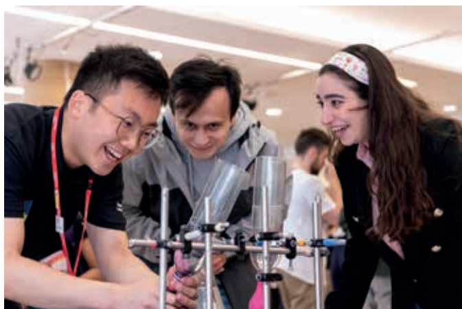
Fun in the laboratory

A great free annual family celebration of science and the arts across Exhibition Road, Imperial College Road and Princes Gardens with engagement from all the great institutions in the area, led by Imperial College.