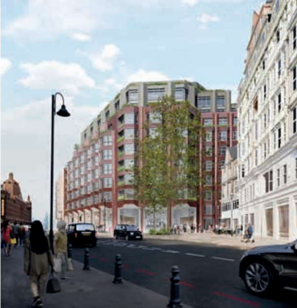
Brompton Road frontage cgi

The planning application for this large 1950s office site on the corner of Brompton Road and Knightsbridge Green finally came before WCC's Major Applications planning committee on the 4 March. The proposal involves partial demolition of the existing building and rebuilding to the full extent of the footprint to provide a 50% increase in office accommodation.