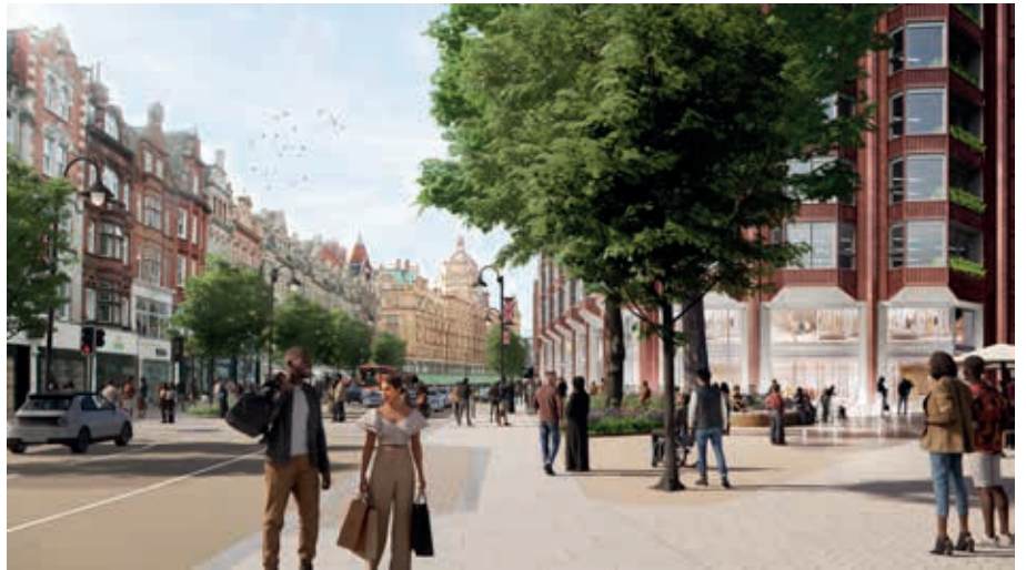
View looking west down Brompton Road cgi