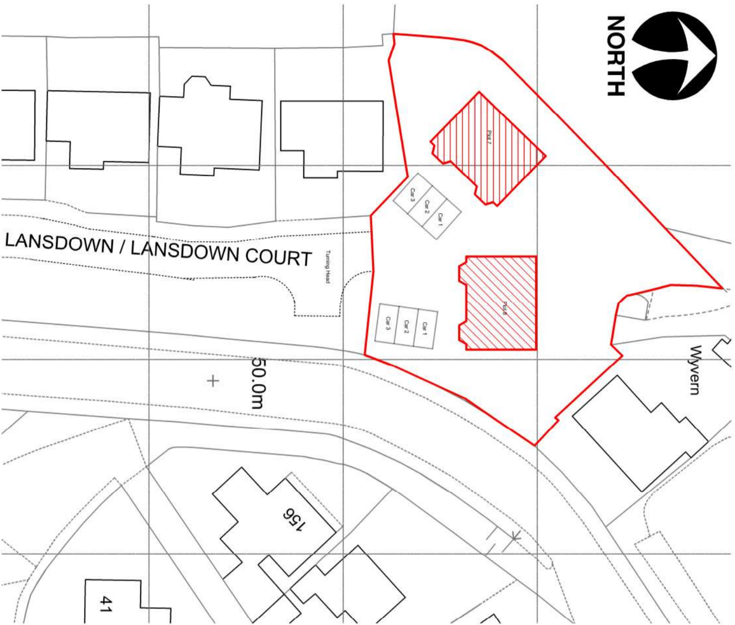
Block Plan 1-500