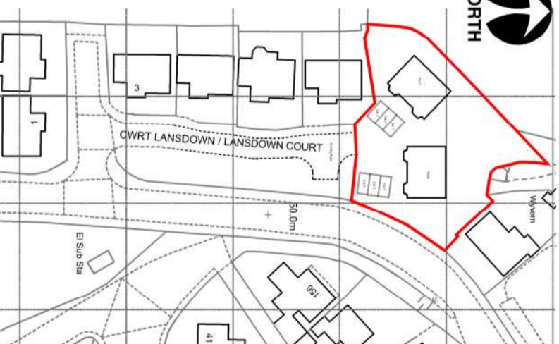
Location Plan 1-1250