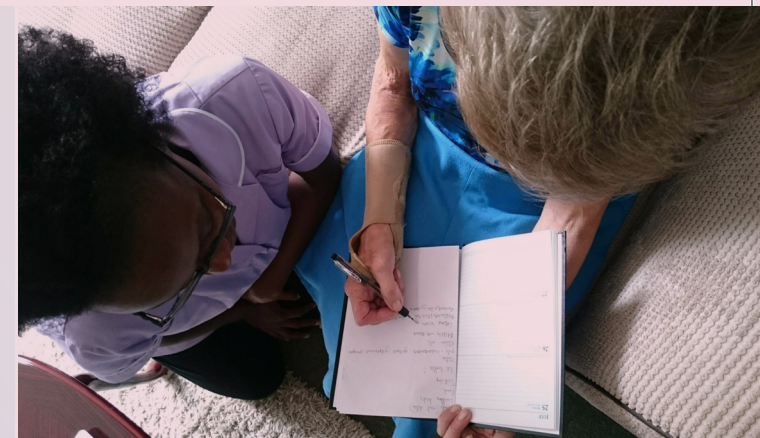
We help with household tasks such as shopping...