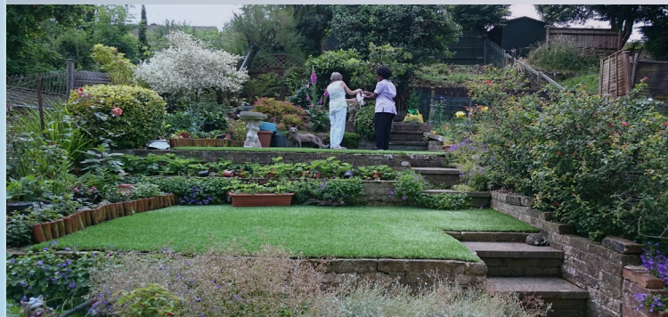
We've even been known to assist with gardening...

With 14 years of experience, from Elderly Care to Physical and Learning Disability Care all the way up to Dementia Care and Palliative Care, we will work with you to find a solution that will suit your needs.