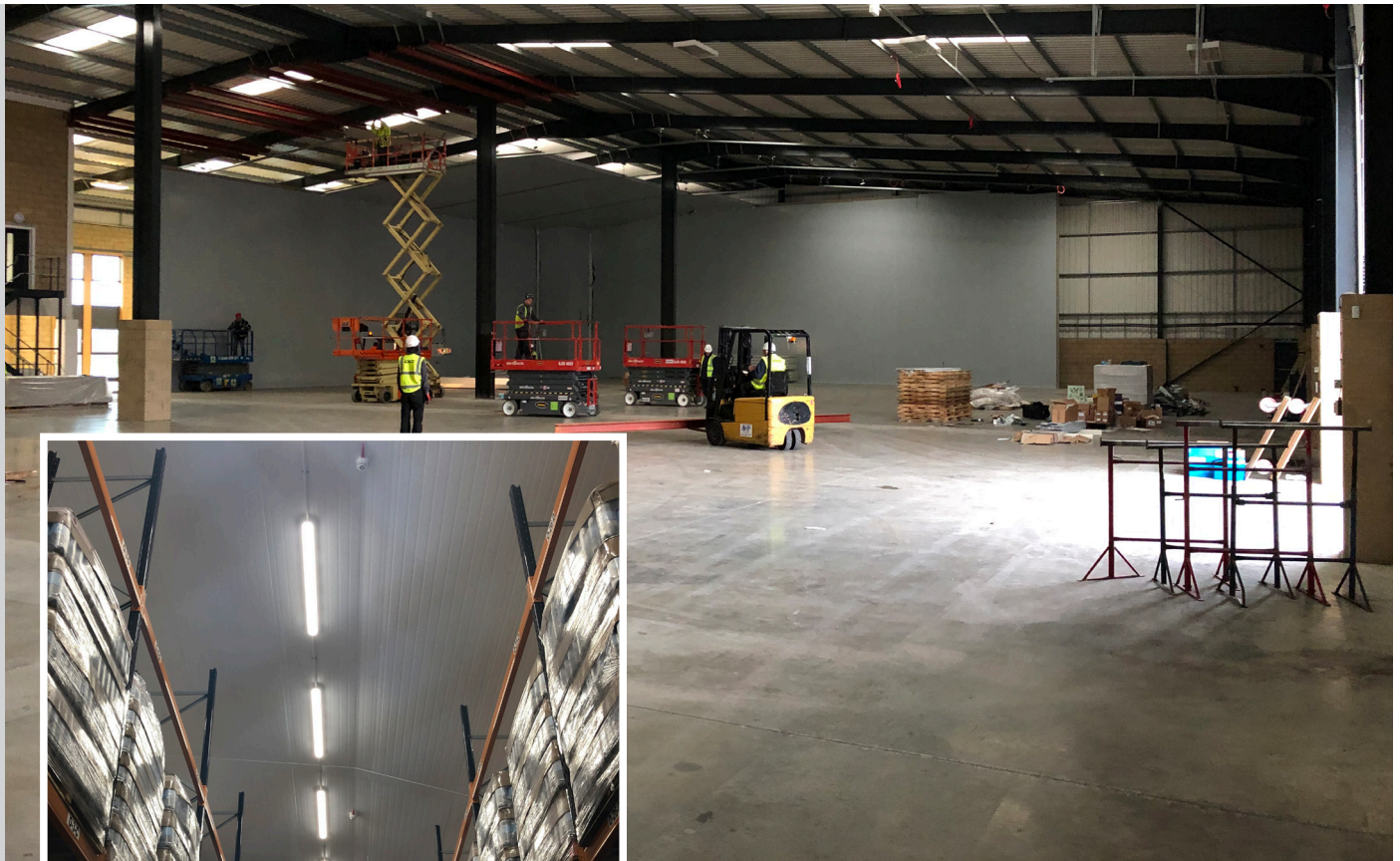
Above: Work starts on constructing the cold room. Left: A high level cooling unit operating in the 35,000 sq. ft. facility.

From here, the company supplies major cruise and ferry lines and overseas retail customers. Alongside duty free beverages and non-chilled items, the facility holds a vast amount of ambient, chilled, frozen and bonded foods - the majority of which require efficient chilling on a large scale.