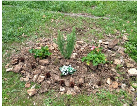
Lipstick's grave at the PAWS clinic