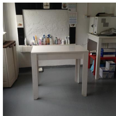
The prep room

Paxos Animal Welfare Society – Registered Charity 1155941