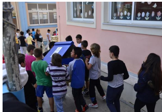
Locating the new feeding station