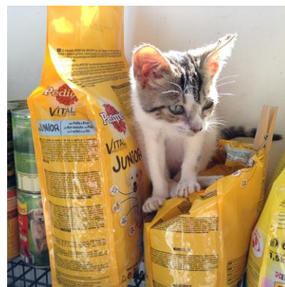
Tabby waiting for supper