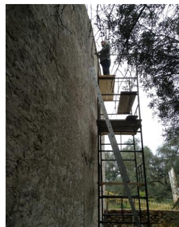
Rod repairing the outside wall