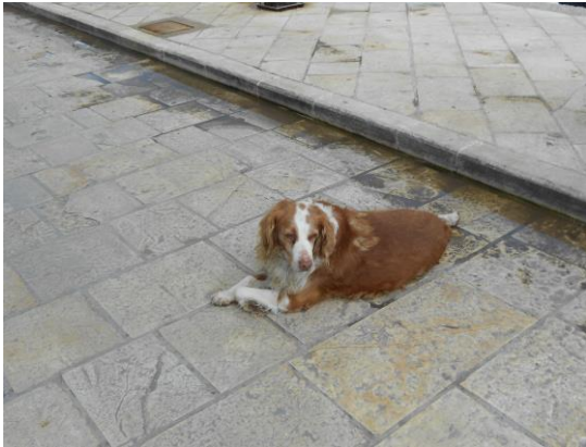
Lipstick in Gaios in 2013