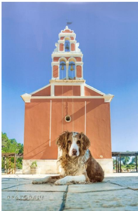
Lipstick on watch in Gaios

Paxos Animal Welfare Society – Registered Charity 1155941