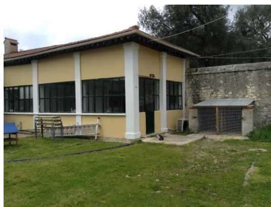
The clinic April 2015