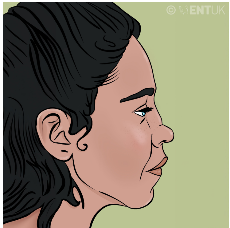
Figure 2. A large hole can cause a change in the shape of the nose (saddle nose)