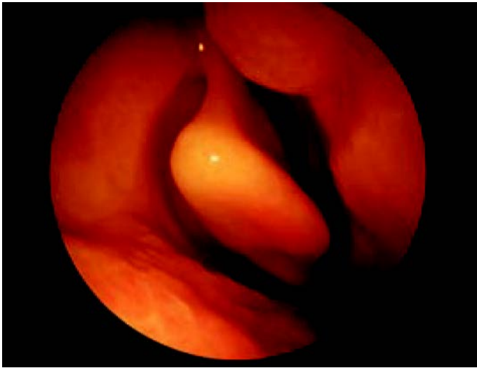
The view inside a 'normal nose'.

Chronic sinusitis is sinusitis that continues for many weeks. Chronic sinusitis may be caused by an acute sinus infection which fails to resolve or as a result of an underlying allergy affecting the lining membranes of the nose and sinuses. Common symptoms include nasal obstruction, headache, nasal discharge, low grade fever, reduced sense of smell, facial discomfort and halitosis.