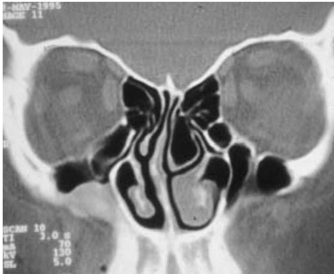
CT scan of normal nose and sinuses.

Occasionally symptoms will persist despite ongoing use of medicines in which case surgery may be necessary. The diagnosis of sinusitis by a specialist will involve the use of a nasal endoscope which the doctor can use to examine the nasal lining and the sinus openings.