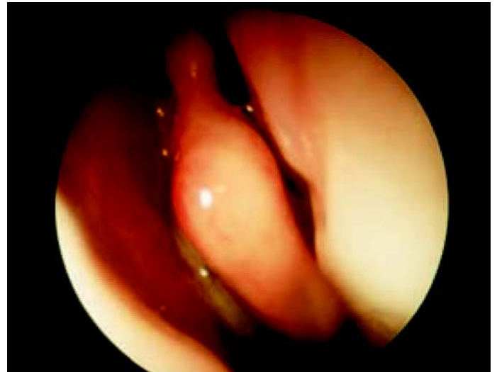
A patient with chronic sinusitis. The thick green mucus associated with a sinus infection can be seen draining into Frontal Sinus the nose.