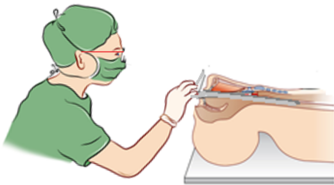
Figure 2. Patient having an upper oesophagoscopy. (© H. Rudert, J. Werner / KARL STORZ SE & Co. KG, Germany - modified by ENT UK)