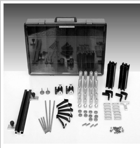
Aberlink Fixture Kit : FK-FIX