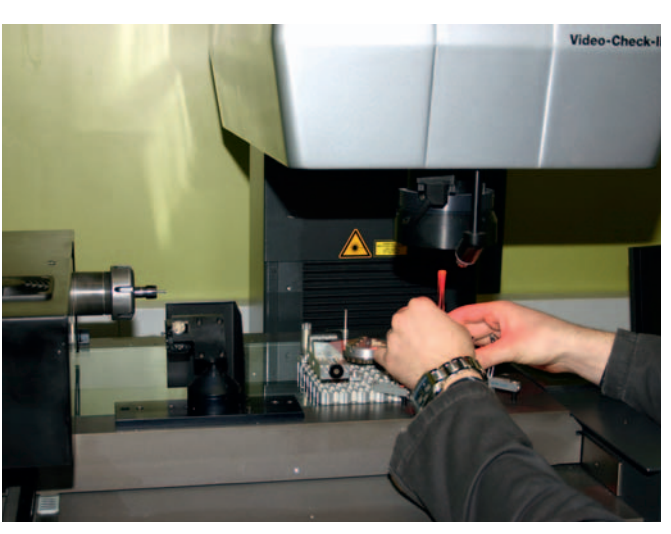
Figure 3. The measurement area was designed such that clamps and most fixtures can remain on the machine, which allows faster changeover of parts.

tactile Werth Fiber Probe WFP also convinced us. As far as I know, there is no alternative to its functionality."