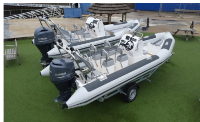
6m and a 6.5m Ballistic

For more information why not visit their website www.ribsforsale.com or phone them on 02392 397000 to make an appointment to do a sea trial.