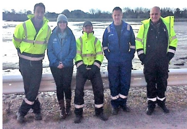
The Trafalgar Ship Yard's team. (from left to right)